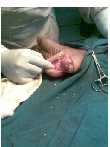
[Table/Fig-3]: Pre - operative 3D CT image of the foot showing the lesion over the plantar aspect of the calcaneum [Table/Fig-4]: Pre-operative clinical picture showing the tumour mass over the heel region [Table/Fig-5]: Intra operative image following excision of the tumour

are associated with the syndrome of multiple hereditary exostoses. The tumours of the hand and feet bones, which include those of the calcaneum, constitute only of 10% the osteochondromas [6]. Cartilage cap thicknesses of greater than 1 to 2 cm in adults and of 2 to 3 cm in growing children suggest a malignant transformation [7]. In the study of Kinoshita et al., among 83 cases of bone and soft tissue tumours of the foot, osteochondroma was the most commonly reported benign tumour. They reported a more common occurrence of the tumour in females who were under the age of 19 years. Radiologically, these tumours can be either sessile or pedunculated. A histological examination of the cartilaginous cap is suggestive of a malignant transformation, if it is more than 2 cm thick. Malignant transformations are seen in less than 1% to 2% of the patients of solitary osteochondroma and in 5%-25% of the patients with multiple hereditary exostoses. Although radiography alone is often diagnostic, other imaging modalities may be necessary for the surgical planning and to exclude a sarcomatous degeneration. MR imaging is the best radiologic imaging method for evaluating the hyaline cartilage cap. The mineralized areas in the cartilage cap had a low signal intensity on the T1 and T2-weighted images [8, 9].